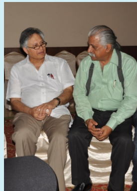
Chairman Sir with Renowned Author Shiv Khera

I strongly believe that: "If YOU succeed, WE succeed, and if YOU fail, WE, as a team, fail. Our team definitely doesn't want to fail. Be a proud AMROITE by joining today."